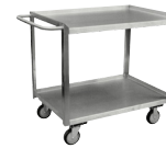
Stainless Steel Service Carts