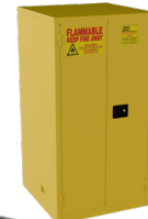
Flammable Safety Cabinets