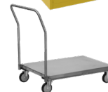
Stainless Steel Platform Trucks