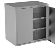
Steel Storage Cabinets