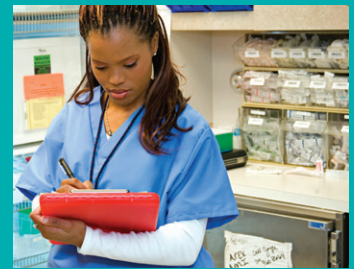
TiltView Bins blend into any setting.