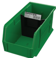
30230 with 41231 Divider and 40000 Divider Label Tab