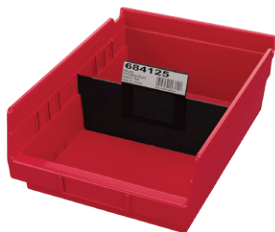
30150 with 40150 Divider and 40000 Divider Label Tab