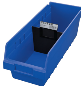
30098 with 40030 Divider and 40000 Divider Label Tab