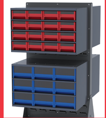
Holds up to four 19-Series Cabinets.