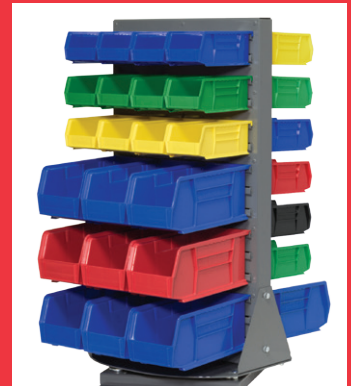
Holds multiple sizes of AkroBins®.