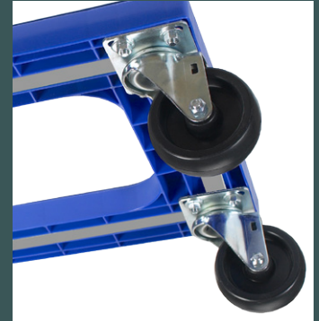
Plate-style 4" polyolefin swivel casters for maximum maneuverability and easy replacement.

Specify color when ordering. AB = Blue, AR = Red, K = Black.