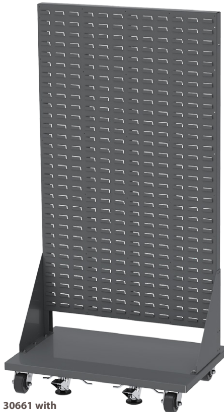
30661 with 30661DOLLYGY